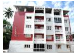
Aria Alvares Road, Mangalore