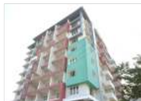
Danube Balmatta Road, Mangalore