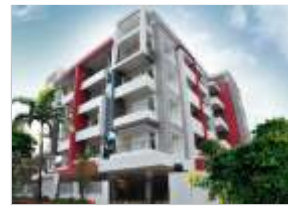
Pushkar Car Street, Mangalore