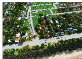
Emerald Bay Surathkal, Mangalore