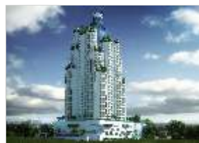
Solitaire Hathill, Mangalore