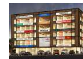
Ananteesh Carstreet, Mangalore