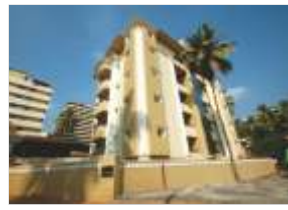
Astoria Balmatta, Mangalore