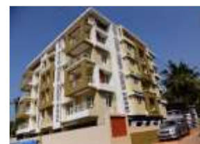
Brookside Morgan's Gate, Mangalore