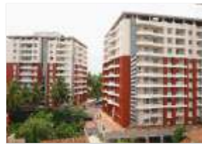
Sai Grandeur Opp. Capuchin Fiary, Jail Road, Mangalore