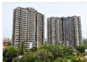
Maurishka Palace Near CV Nayak Hall, Kadri Kambla, Mangalore