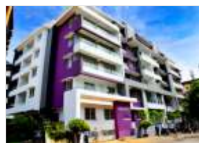
Aquarius Mallikatta, Mangalore