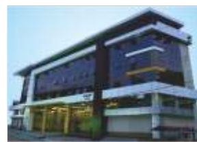
Aadheesh Off M.G. Road, Mangalore