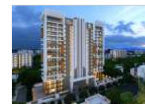
Nakshatra Gandhinagar, Mangalore