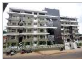
Adonia Alvares Road, Kadri, Mangalore