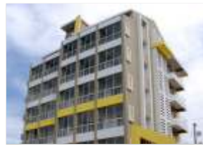
Hathill Crest Hat Hill, Mangalore