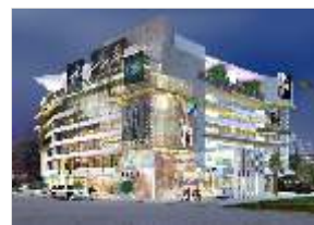
Milestone 25 Balmatta, Mangalore