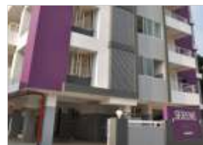
Serene Bejai, Mangalore