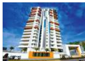
Atlantis Bendoorwell, Mangalore