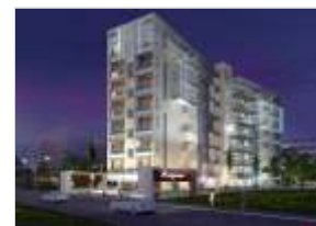
Insignia Valencia, Mangalore