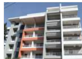
Hillside Ferns Shivbagh, Mangalore