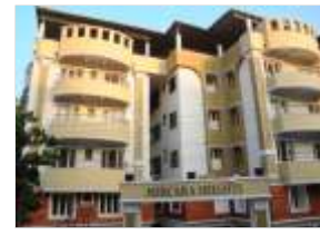
Mercara Heights Mercara Hill Road, Bendore, Mangalore