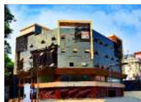
Parin Collector's Gate, Balmatta, Mangalore