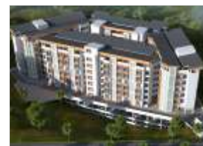
Habitat One54 Derebail, Mangalore