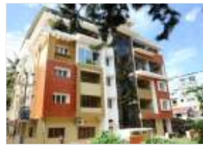
Orion Lobo Lane, Mangalore