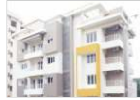
Vijaya Lobo Lane, Mangalore