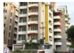
Rehoboth Bejai, Mangalore