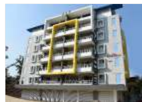
Vasundhara Opp. Urva Marigudi Temple, Mangalore