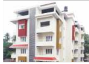
Aadhee Lobo Lane, Mangalore